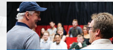
Colin Mochrie, Guest Speaker